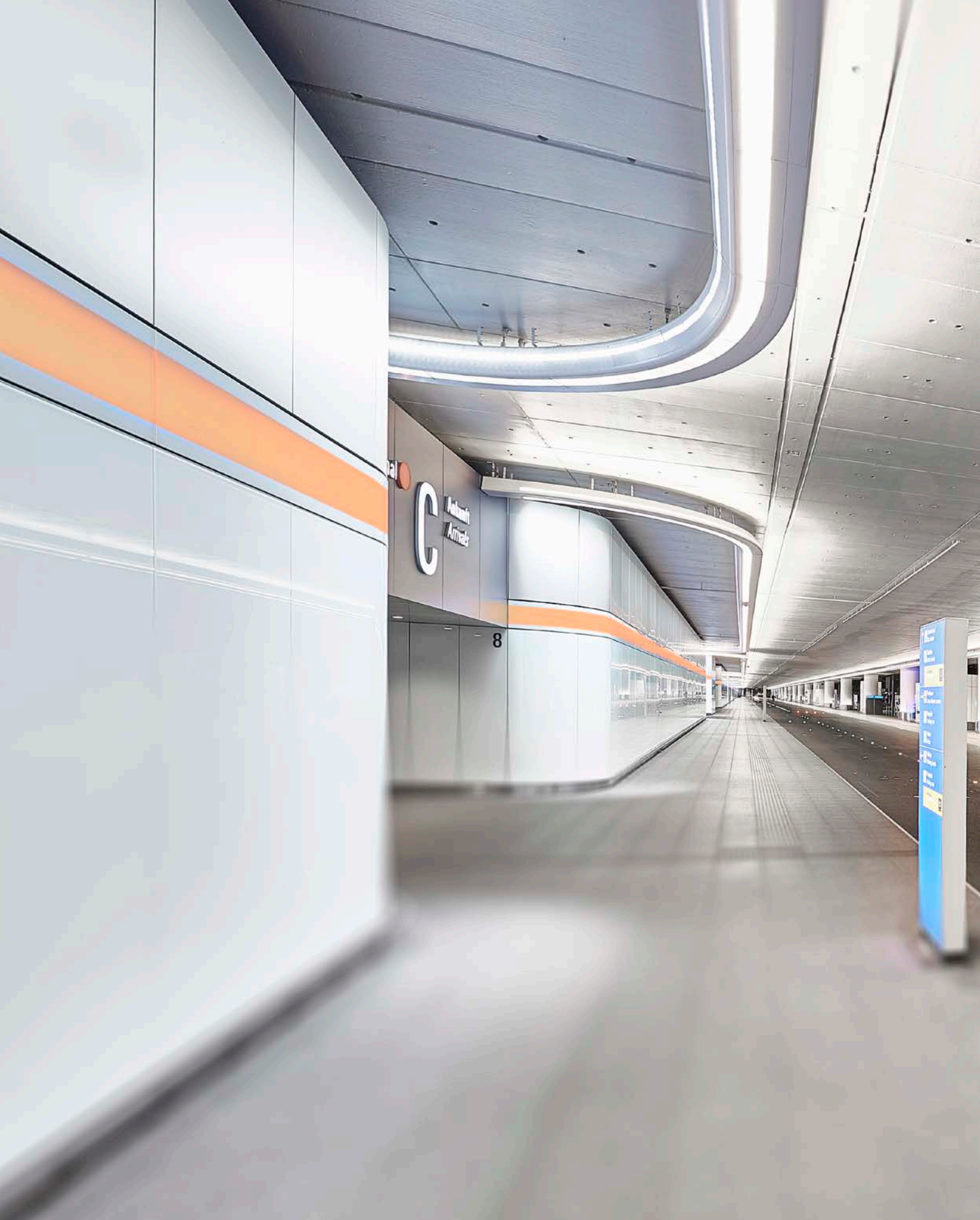
A pleasant take-off and landing at Frankfurt Airport Terminal 1 – a light-flooded space with a high atmospheric quality. Schnick-Schnack-Systems provided the LEDs for the strip lighting that is more than 430 meters long, every single LED Tile was specially equipped with outdoor connectors. The Terminal was opened in summer 2016 following 15 months of construction.